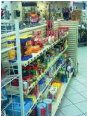
Convenience Stores / Dollar Stores / Gift Shops