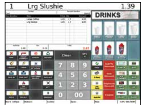
Graphic screens guide operators with minimal training. Condiments, flavors, instructions and options can be placed upon one key. When an item is registered, a specific key displays the options available for the item.