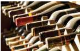
Tobacco / Wine / Small Grocery Stores