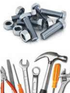
Hardware, Paint or General Retail Stores