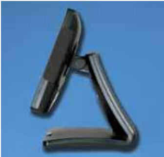
Sleek and Stylish Cabinet Design