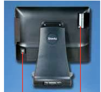
Two Additional USB Ports