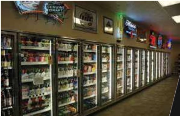
Beer / Liquor Stores