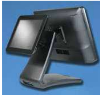
Optional Integrated 9.7" and 15" Rear LCD Customer Displays