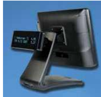
Optional Integrated Rear 2 Lines by 20 Characters VFD Customer Display