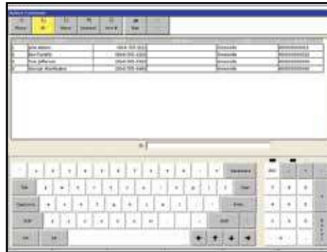
No back office PC is required to make changes or additions to the system tables.